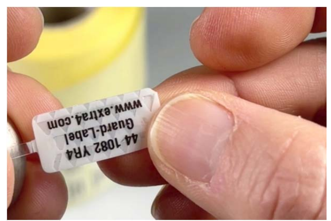
Fig.3: Once opened, the pattern effect cannot be revised even by precisely repositioning the label areas