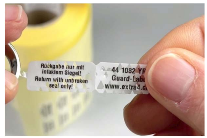
Fig.2: Even with thermal transfer printing, the security pattern of PRIME-Guard Labels is easily detectable after reopening